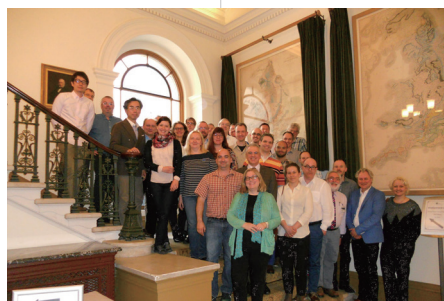
Members of an international academic committee at the Geological Society of London

There are also meetings where specific areas of expertise are discussed in more depth. Within an academic organization named the International Union of Laboratories and Experts in Construction Materials, Systems and Structures (RILEM), there is a technical committee dedicated to the discussion of how to avoid alkali aggregate reactions that are one type of reaction that cause concrete to deteriorate. The photo below is of participants in a meeting held in London. Researchers from throughout the world gather about once every six months to conduct professional discussions. Meeting with leading researchers from other countries and sharing our latest findings in this way helps to broaden our knowledge as we continue to pursue research useful to environmental recovery.