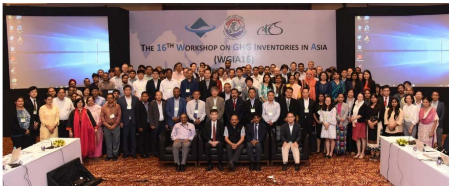
WGIA16 in India (2018)