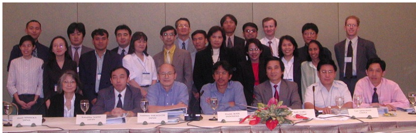
WGIA1 in Thailand (2003)